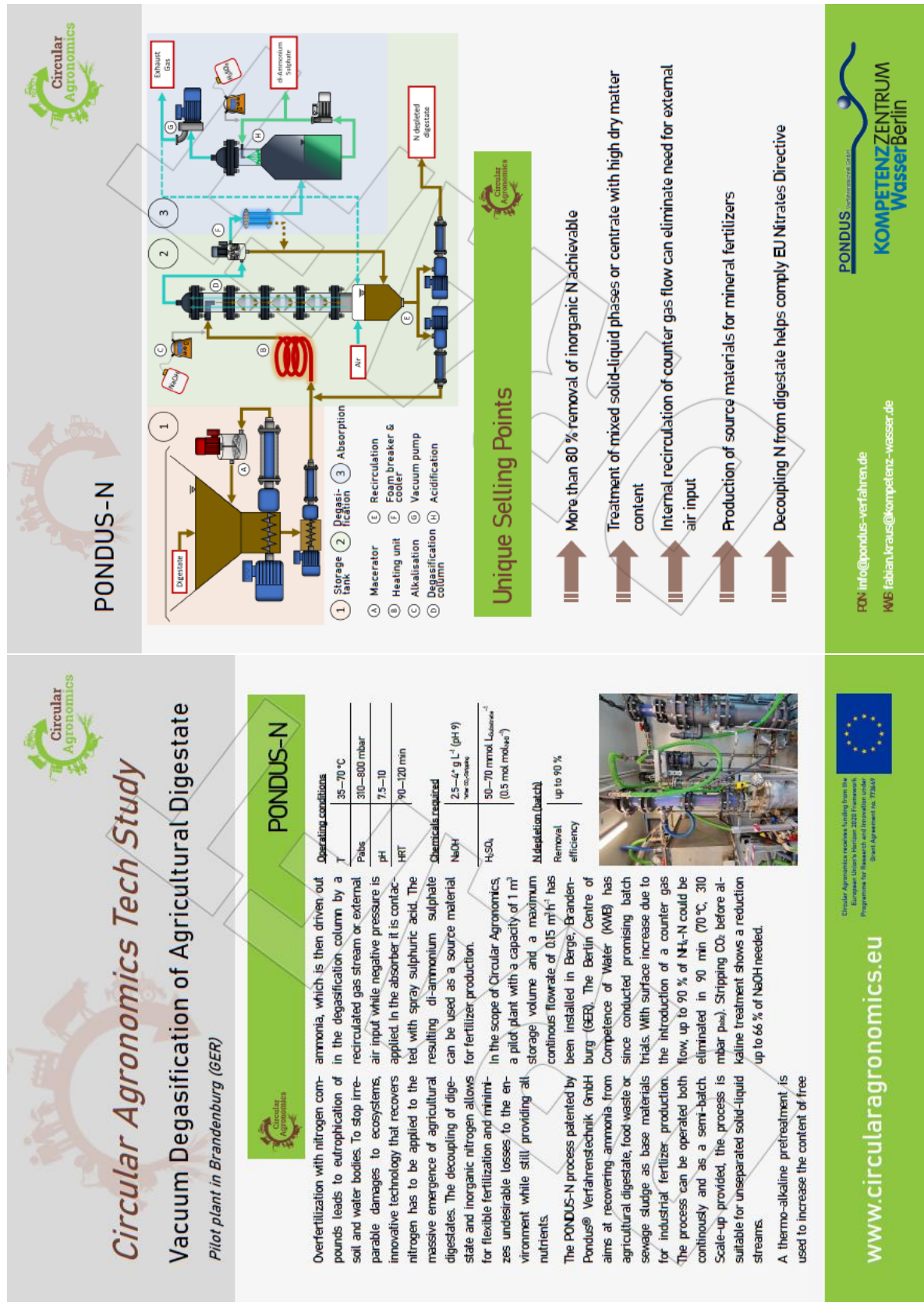
Figure 1: Draft of TECH brochure for vacuum degasification of agricultural digestate